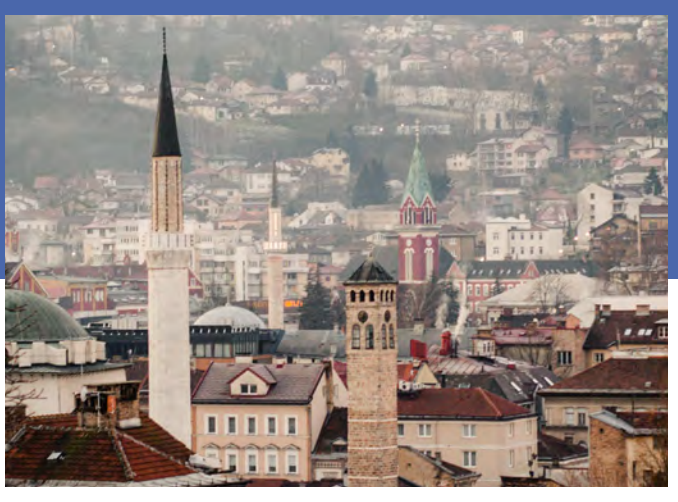
Location: Sarajevo – Recognized as one of the best world destinations for 2025 by National Geographic's readers.

Tuition: 1,599 EUR (Includes tuition, accommodation, and meals)